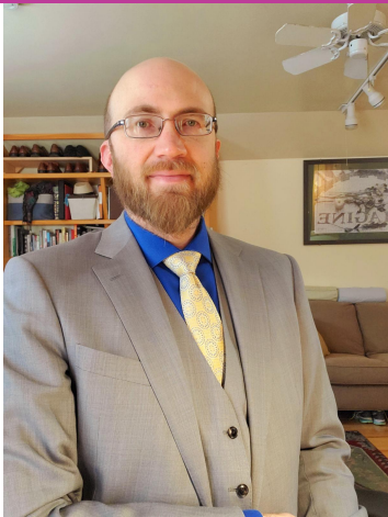
Your Conference staff working for you

CARES Act information courtesy of the Southern New England Conference