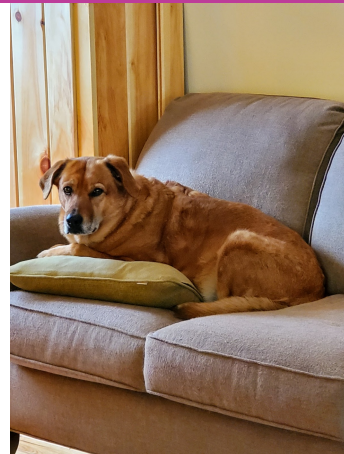
Sable likes the working from home concept