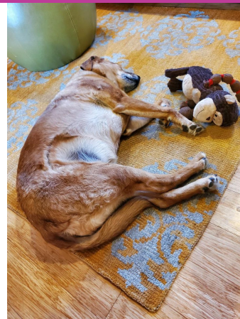
Well, most of us are...