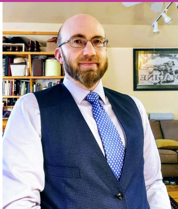
Your Conference staff working for you

The Vermont Conference office is closed, but we're still hard at work for you!