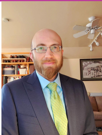
Your Conference staff working for you

CARES Act information courtesy of the Southern New England Conference